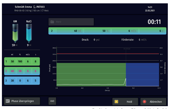
Graphical user interface will be available in English once Accutron® CT-D Vision is commercially available