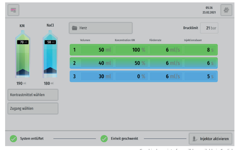
Graphical user interface will be available in English once Accutron® CT-D Vision is commercially available.