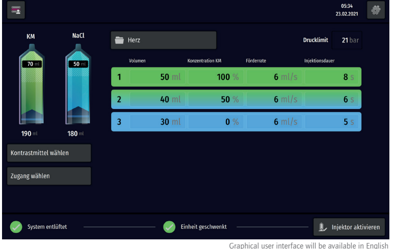
once Accutron® CT-D Vision is commercially available.

Inside the exam room, the choice of the light mode display on the injector screen enhances the readability of key parameters. In the low light of the console room, the operator can choose the dark mode display to reduce visual disturbances and allow the focus on the imaging procedure.